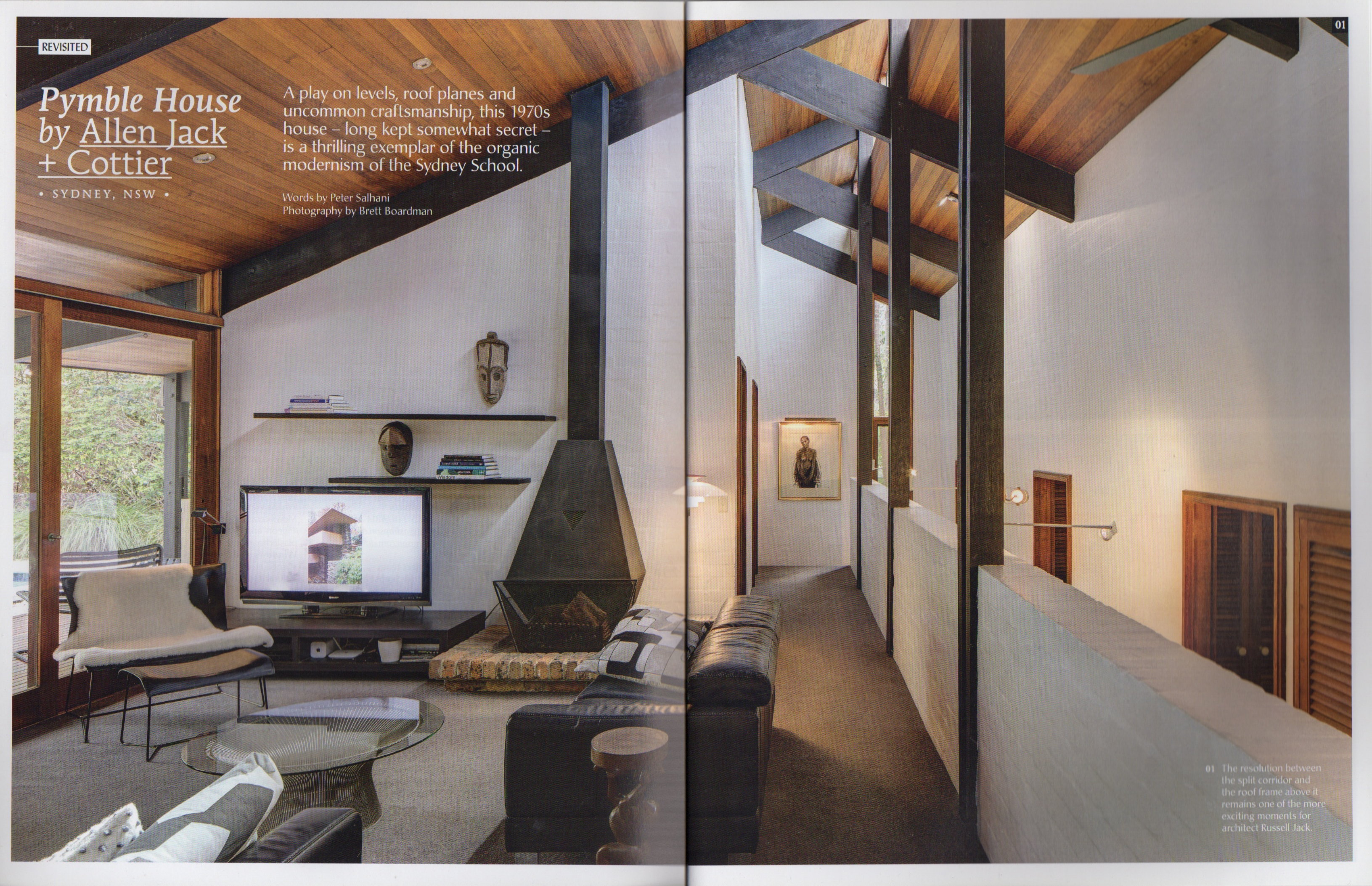
01 The resolution between the split corridor and the roof frame above it remains one of the more exciting moments for architect Russell Jack.

Words by Peter Salhani